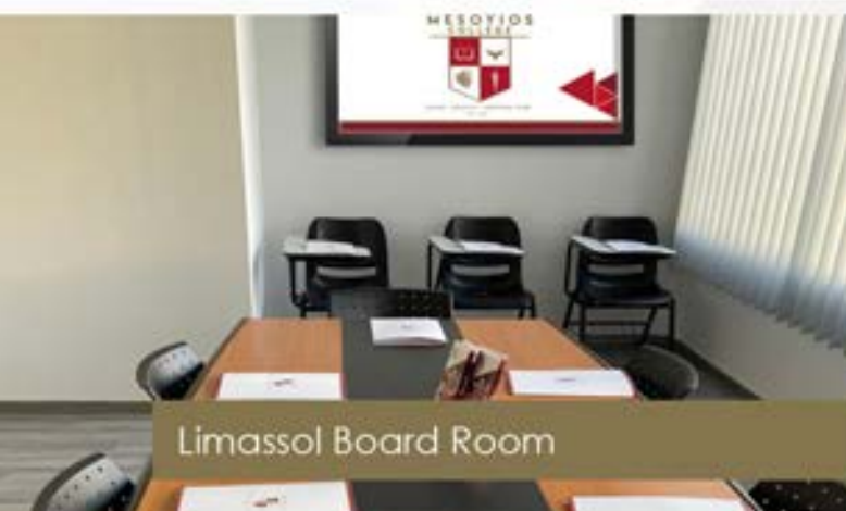
Limassol Board Room