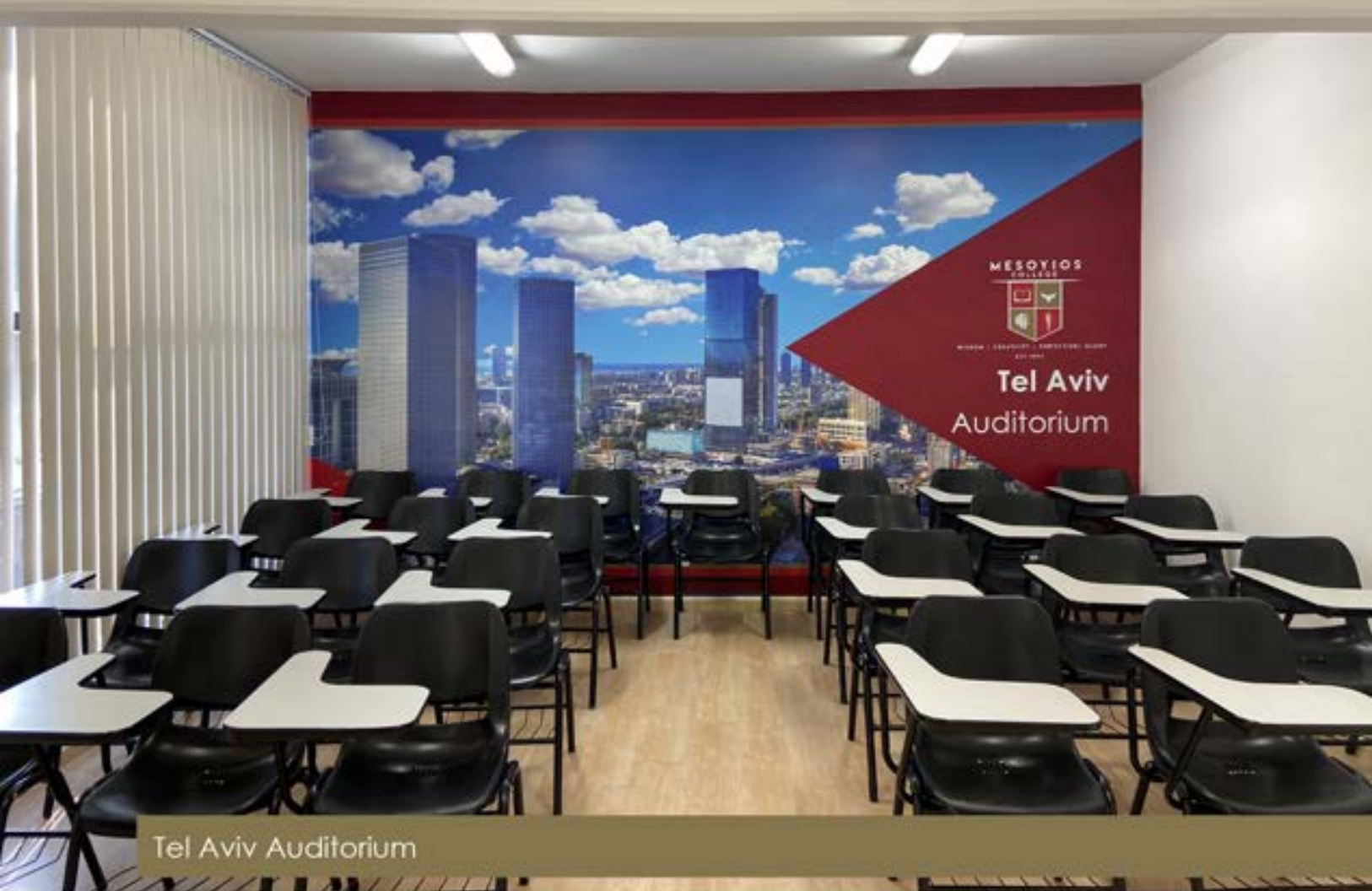
Tel Aviv Auditorium