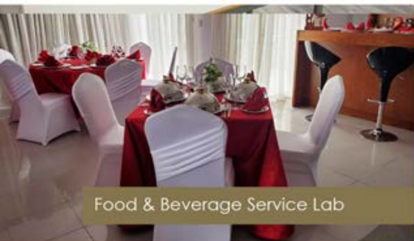
Food & Beverage Service Lab