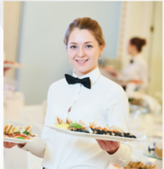
* This program has been submitted to the CYQAA for accreditation