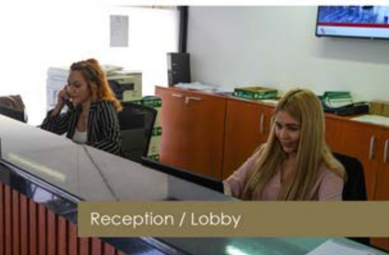
Reception / Lobby