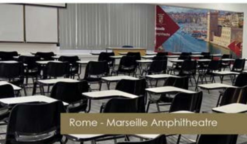
Rome - Marseille Amphitheatre