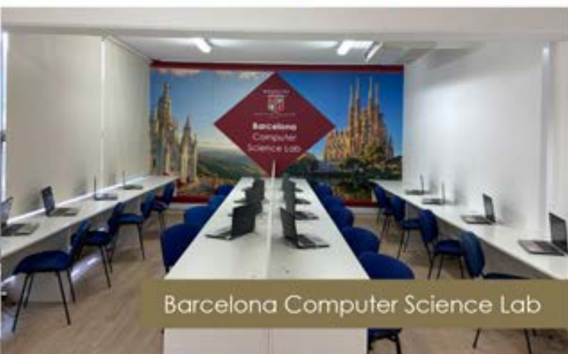
Barcelona Computer Science Lab